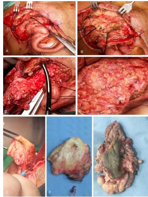
Figure 2 Patient underwent superficial parotidectomy with predictable safety of the facial nerve and its branches (A-D). Excision of frontal lesion (E) is depicted and frontal lesion (F) and parotid lesion (G) specimens have been shown.